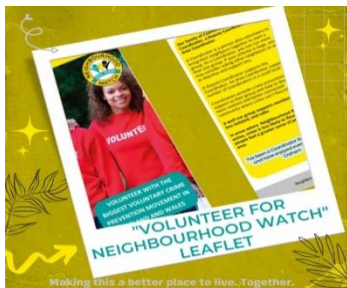
Pack of 50 'Volunteer for NW' - £6.00