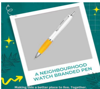
NW branded pens - £3.00 each