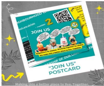
Pack of 50 'Join Us' postcards - £4.00