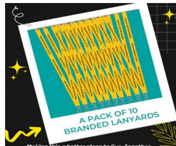
Pack of 10 lanyards - £15.00