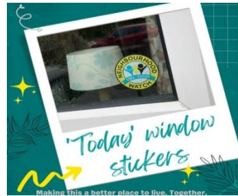
Pack of 50 window stickers - £2.50