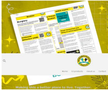
Pack of 25 Crime Prevention leaflets - £5.00

The stall would need leaflets, stickers, membership forms, witness checklists etc to hand out. Possible options to purchase could be: