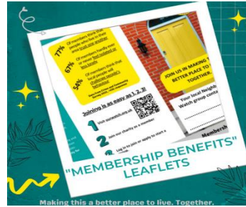
Pack of 50 Membership Benefits leaflets - £6.00