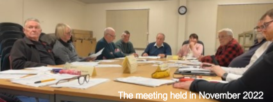
The meeting held in November 2022