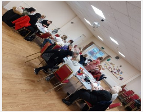
A warm space held in November 2022

Organisers have received excellent feedback from people that come saying it's a lovely atmosphere, a